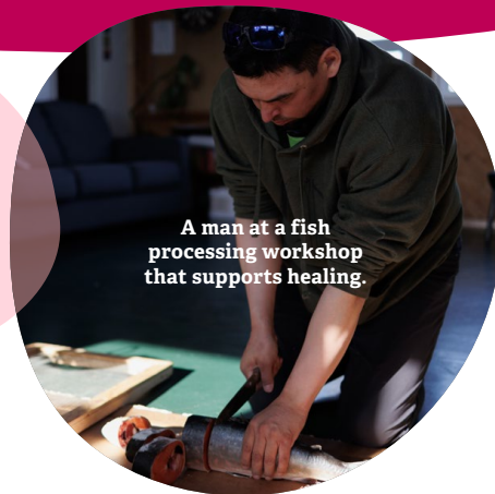
A man at a fish processing workshop that supports healing.

It helps people recover from trauma and addiction, enabling all members of the family to come together on the path to reconciliation and well-being.