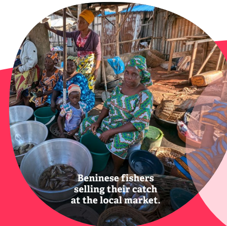
Beninese fishers selling their catch at the local market.

In 2025, the projects we support will impact more than 71,000 people in 11 countries. Our vision of international cooperation is based on inclusive, feminist, ecological, decolonial 1 and anti-racist values.