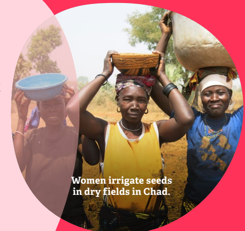
Women irrigate seeds in dry fields in Chad.

In Chad, the RCIM 2 project helps women farmers of different generations adopt environmentally friendly practices, thereby improving food security and the economic power of the women and their families.