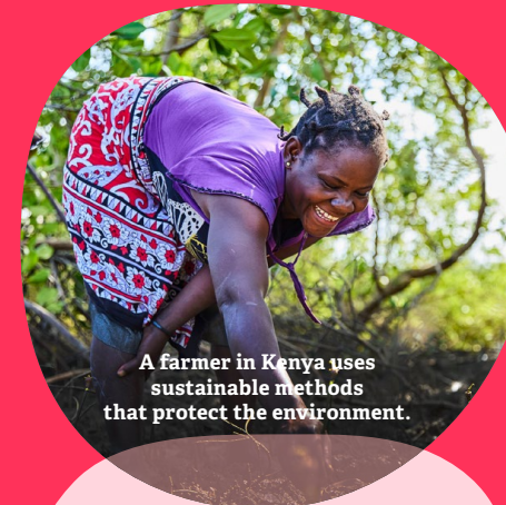
A farmer in Kenya uses sustainable methods that protect the environment.

This program will strengthen our presence in Benin and Bolivia over the coming years by supporting initiatives to develop sustainable, community-driven solutions.