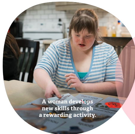
A woman develops new skills through a rewarding activity.